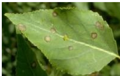
Figure 3: Septoria leaf spot showing tan circular spots.

distinct tan circular spot with black margins and small black pimples in the center (Figure 3), and irregular brown to black spots that coalesce into large areas (Figure 4).