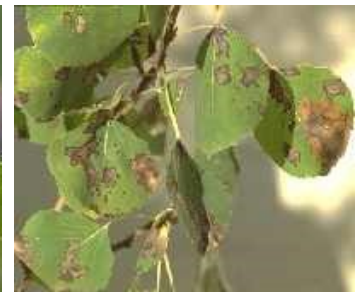
Figure 2: Marssonina leaf spot on aspen, late symptoms.

Marssonina survives the winter on fallen leaves that were infected the previous year (Figure 9). With spring and warmer, wet weather, the fungus produces microscopic "seeds" or spores that are carried by the wind and infect emerging leaves. Early infections are rarely serious, but if the weather remains favorable, spores from these infections can cause a widespread secondary infection. Heavy secondary infections become visible later in the growing season and cause premature leaf loss on infected trees.