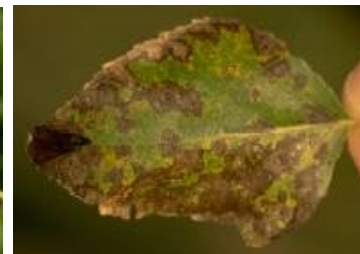
Figure 4: Septoria leaf spot showing irregular brown spots.

The disease is rarely a problem on plains and eastern cottonwoods but can cause considerable damage on lanceleaf cottonwoods. In wetter climates, the fungus also causes cankers on twigs and main stems.