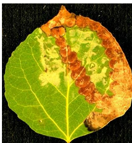
Figure 5: Ink spot disease on aspen in early summer.

leafminer attacks. Infected leaves may be totally brown by midsummer, while adjacent uninfected leaves remain green. Raised black bodies begin to appear on affected brown leaves. These hard masses of fungal material are oval and nearly 1/4 inch long. These are the "ink spots" that give the disease its common name (Figure 6). In late summer, these spots fall out, leaving a characteristic "shot hole" effect on leaves that remain on the tree. This disease is especially prevalent in dense aspen stands. Early defoliation may reduce growth.