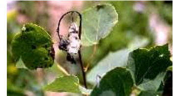
Figure 7: Shoot blight on aspen showing black and curled stem.

In the spring, symptoms first become visible on leaves near shoots infected the previous season. Brown to blackened, irregularly shaped areas spread through the leaves, causing them to dry and become distorted. Typically, the fungus spreads down through the succulent new shoot, causing cankers that blacken and curl the stem tip until it resembles a shepherd's crook (Figure 7). Death of new shoots causes distorted, shrubby growth.