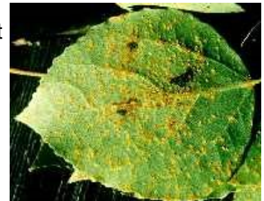
Figure 8: Leaf rust.

The life cycle of this fungus requires two different tree hosts. During wet spring weather, spores are released from the fungus, which has overwintered on fallen cottonwood or aspen leaves. These spores infect evergreen needles, such as Douglas-fir, pine, fir or spruce, where they cause little damage. After two to three weeks, spores are produced on these evergreen hosts and are blown to aspen or cottonwood leaves. Once the rust is established on aspen or cottonwood hosts, it can multiply rapidly under favorable wet conditions throughout the summer. Several years of heavy infections can cause some growth losses, especially on younger trees. Fallen infected leaves shelter the fungus until the next year's disease cycle.