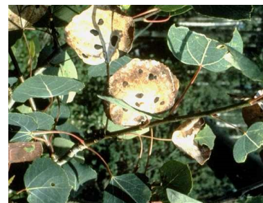
Figure 6: Ink spot disease on aspen in midsummer.

The hard fungal tissue masses that fall from infected leaves are the overwintering stage of the fungus. Wet spring weather stimulates spore production. Spores are blown and splashed from the ground to developing leaves.