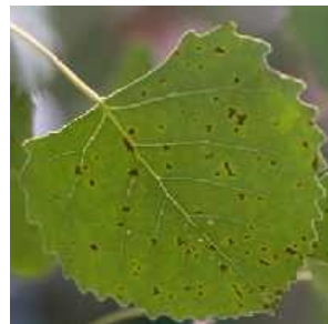
Figure 1: Marssonina leaf spot on cottonwood.

Marssonina leaf spots are dark brown flecks, often with yellow halos (Figure 1). Immature spots characteristically have a white center. On severely infected leaves, in wet weather, several spots may fuse to form large black dead patches (Figure 2). Spots also may develop on leaf petioles and succulent new shoots.